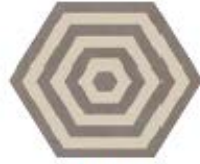
CP60TA TARGET ASHGREY Ø 60