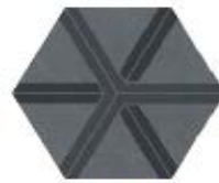
CP60PG PLOT GREY Ø 60