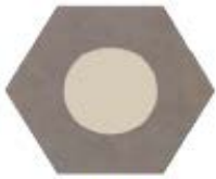
CB60DPA DOT-POSITIVE ASHGREY Ø 60