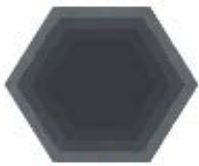
CP60HG HONEYCOMB GREY Ø 60