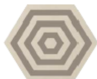
CP60TI TARGET IVORY Ø 60