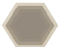
CP60HI HONEYCOMB IVORY Ø 60