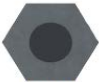
CB60DPG DOT-POSITIVE GREY Ø 60