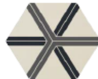
CP60PW PLOT WHITE Ø 60