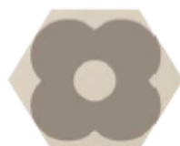
CP60PI PETALS IVORY Ø 60