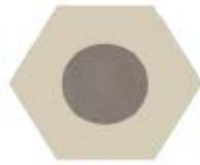
CB60DNA DOT-NEGATIVE ASHGREY Ø 60