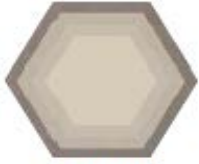
CP60HA HONEYCOMB ASHGREY Ø 60