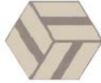
CP60RA RUN-UP ASHGREY Ø 60