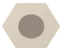
CB60DPI DOT-POSITIVE IVORY Ø 60