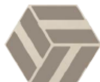
CP60RI RUN-UP IVORY Ø 60