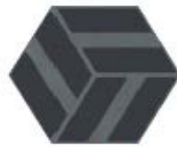
CP60RG RUN-UP GREY Ø 60