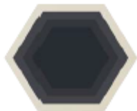
CP60HW HONEYCOMB WHITE Ø 60