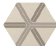
CP60PI PLOT IVORY Ø 60