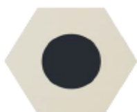
CB60DPW DOT-POSITIVE WHITE Ø 60