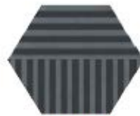
CP60SG STRIPES GREY Ø 60