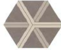
CP60PA PLOT ASHGREY Ø 60