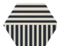
CP60SW STRIPES WHITE Ø 60