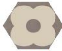
CP60PA PETALS ASHGREY Ø 60