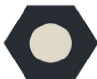
CB60DNW DOT-NEGATIVE WHITE Ø 60