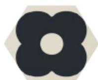
CP60PW PETALS WHITE Ø 60