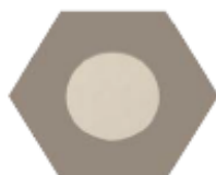
CB60DNI DOT-NEGATIVE IVORY Ø 60