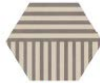
CP60SA STRIPES ASHGREY Ø 60