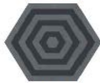
CP60TG TARGET GREY Ø 60