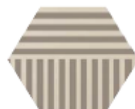
CP60SI STRIPES IVORY Ø 60