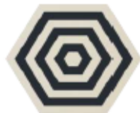
CP60TW TARGET WHITE Ø 60