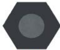
CB60DNG DOT-NEGATIVE GREY Ø 60