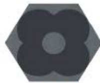
CP60PG PETALS GREY Ø 60